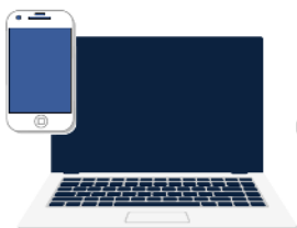
CELL PHONE OR COMPUTER WITH WEBCAM